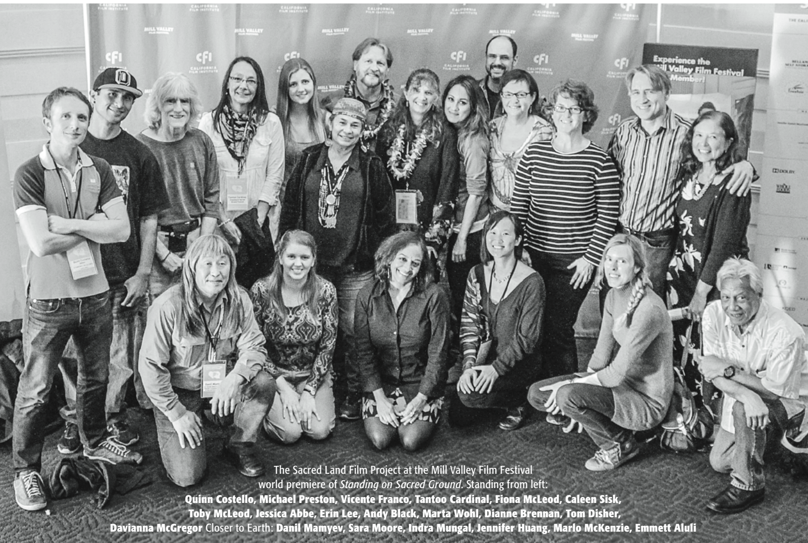
The Sacred Land Film Project at the Mill Valley Film Festival world premiere of Standing on Sacred Ground . Standing from left: